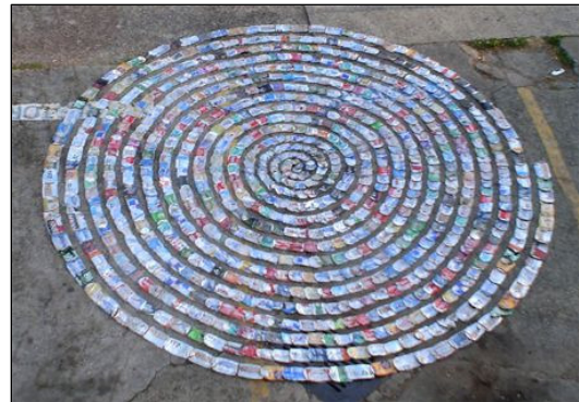
1,000 Flattened Can Spiral , 2005. Robert Zverina, www.zverina.com