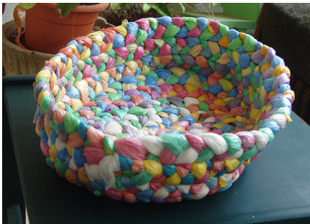
Plastic bag basket